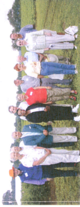
ESA board members say "Become a member! Please join us in supporting this great organization!"

We pay for our Bulletin and partially subsidize our field trips. In addition, ESA spends its