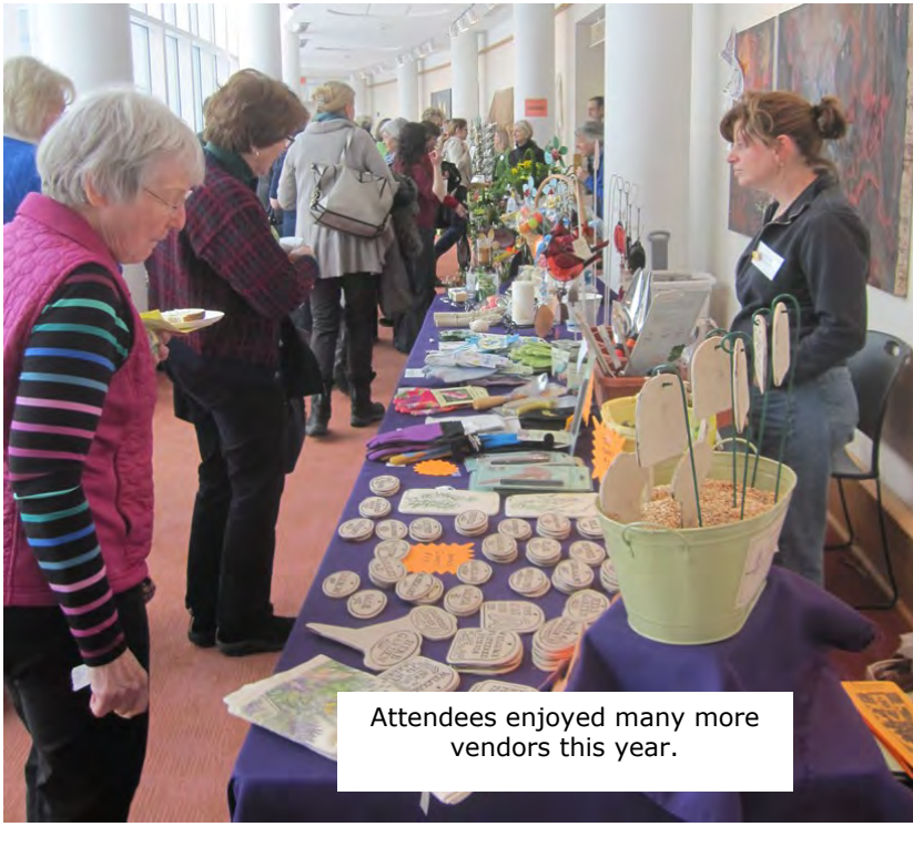
Attendees enjoyed many more vendors this year.

Despite lingering snow and cold winds, the symposium was well attended and bustling with activity.