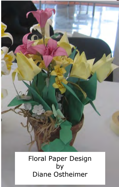
Floral Paper Design by Diane Ostheimer