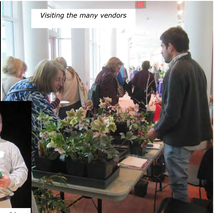
Visiting the many vendors