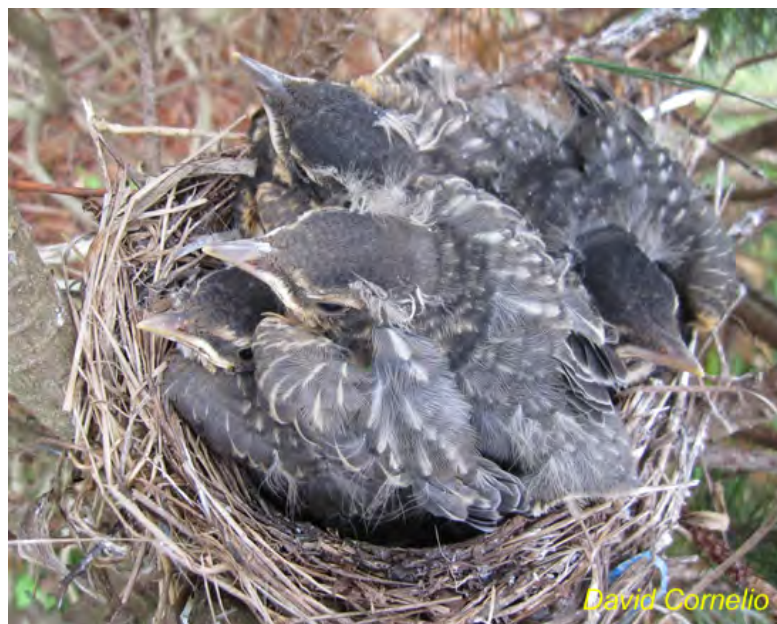
Fledgling robins in a pine tree

Once baby birds leave the nest and adult birds begin to switch their diet to your berries, netting and row covers will deter them. As for my vegetables, I always plant enough to share as a thank you for keeping my yard organic and pest free!