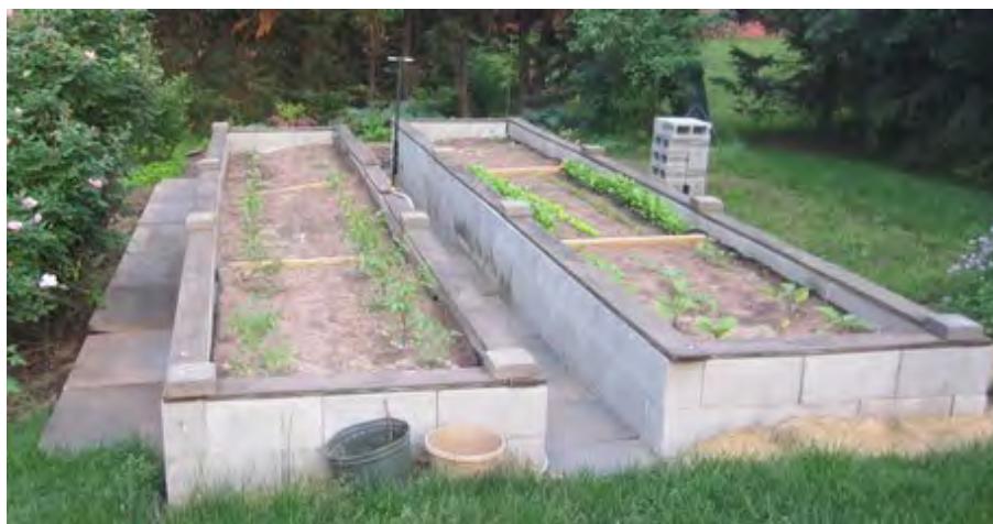
Due to the grade, the third course is under ground in the front while above ground in the back of the raised beds.

Did the benefits outweigh the expense and effort? Absolutely!! I originally calculated that it would take seven years of produce value to repay the cost of the construction. After the first year, I've decreased the time to three years.